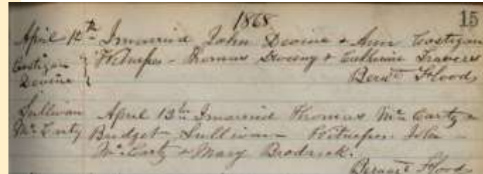
St. Mary's, Waltham marriages, 1868

You cannot search on address to find all the people who were born or married or who died at a particular address. In the 19th century, vital records did not list the street address. But we also have information from the deeds and maps about who lived in the house. So we can search their names in the vital records (births, marriages & deaths). For Waltham, the vital records to 1850 were published in book form and have been digitized by Ancestry. You can look at the book at the Waltham Public Library. Beginning in 1841, the state collected vital records, and these are available online on Ancestry, familysearch and Americanancestors. Saint Mary's baptisms and marriages from 1850 to 1900 are available on American Ancestors.