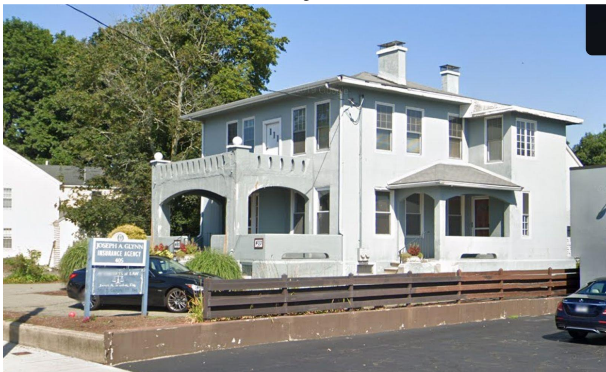
Google street view 2020