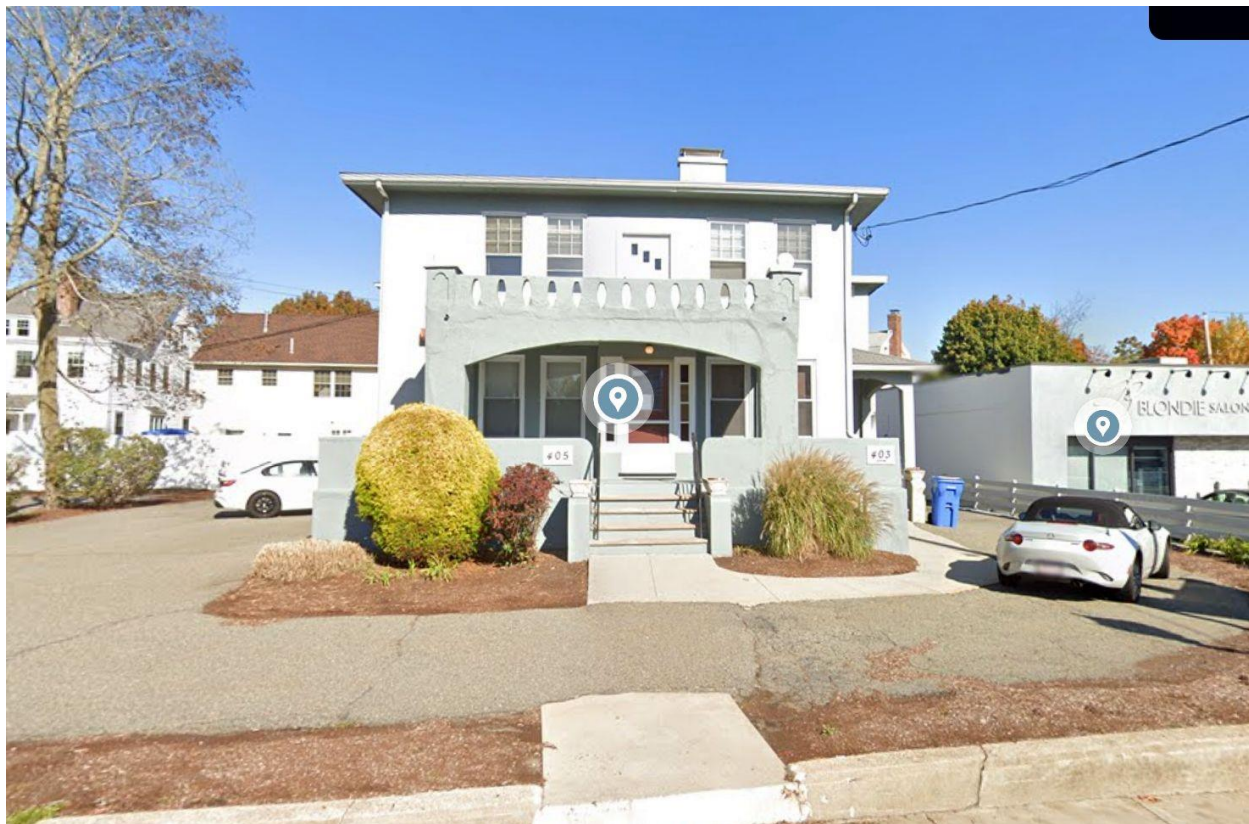
Google street view 2022