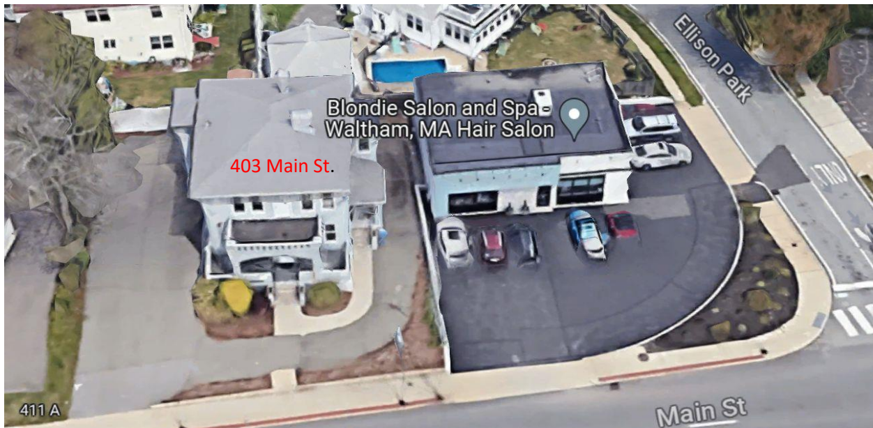
Google satellite view 2023